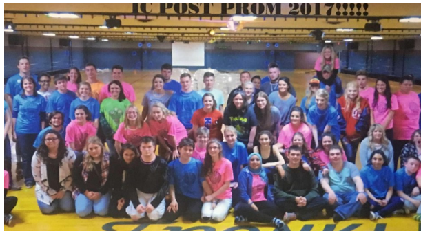
Left: CGMSC Youth Council Activity. Above: ICHS Post Prom

Of the 7th graders who reported using a substance, the average age of first use of alcohol was 11.3 years old, and 11.7 years old for trying cigarettes — 5th graders! It's never too early to start talking to youth about the dangers of substance use, and setting expectations of non-use.