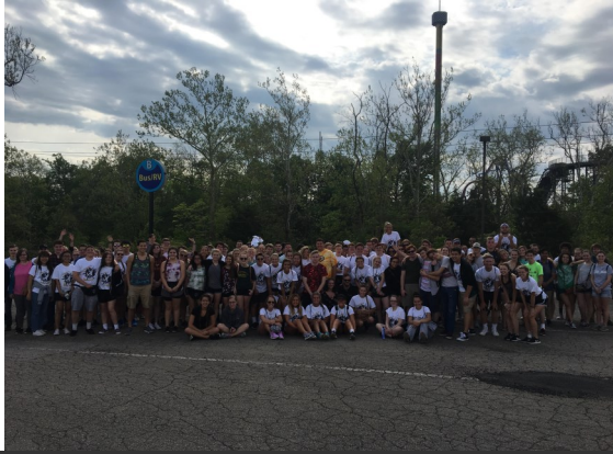
GHS Post Prom